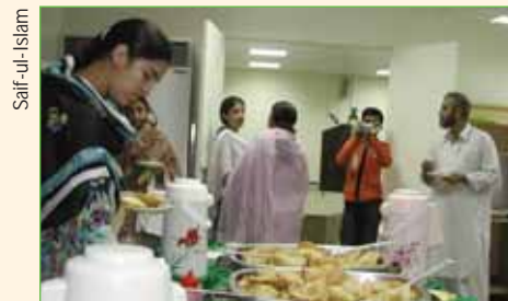
Guests enjoying tea and samosas (stuffed pastry common to the Middle East)