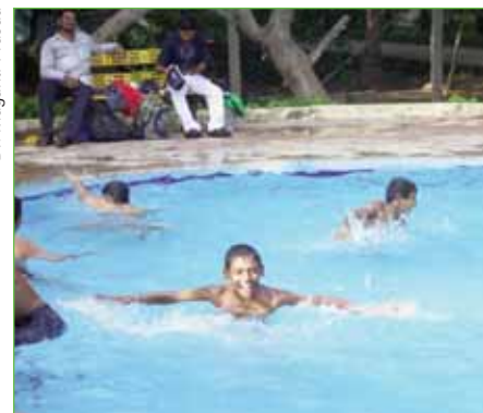
The children enjoy a swim!

bleed, not to mention for the 20-30 bleeds that occur per year, such as in Praneeth’s case.